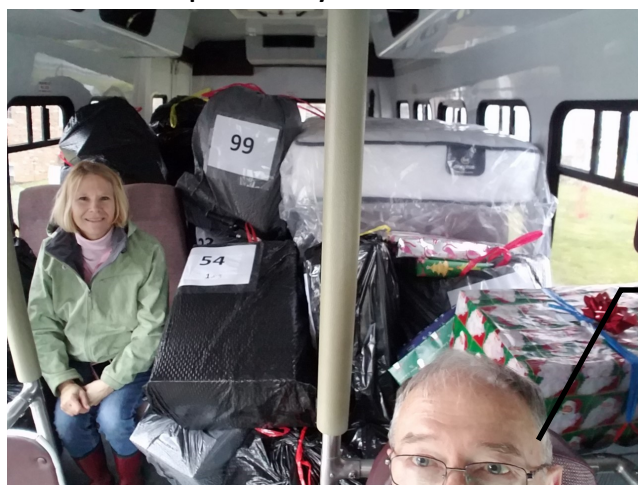
Delivering presents to Campbell County Social Services